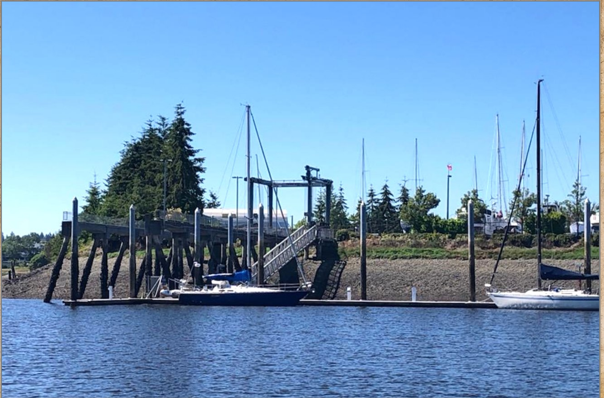
This facility, built-in 1999, is the Southernmost Boatyard in the Puget Sound and performs over 600 Boatlifts a year.