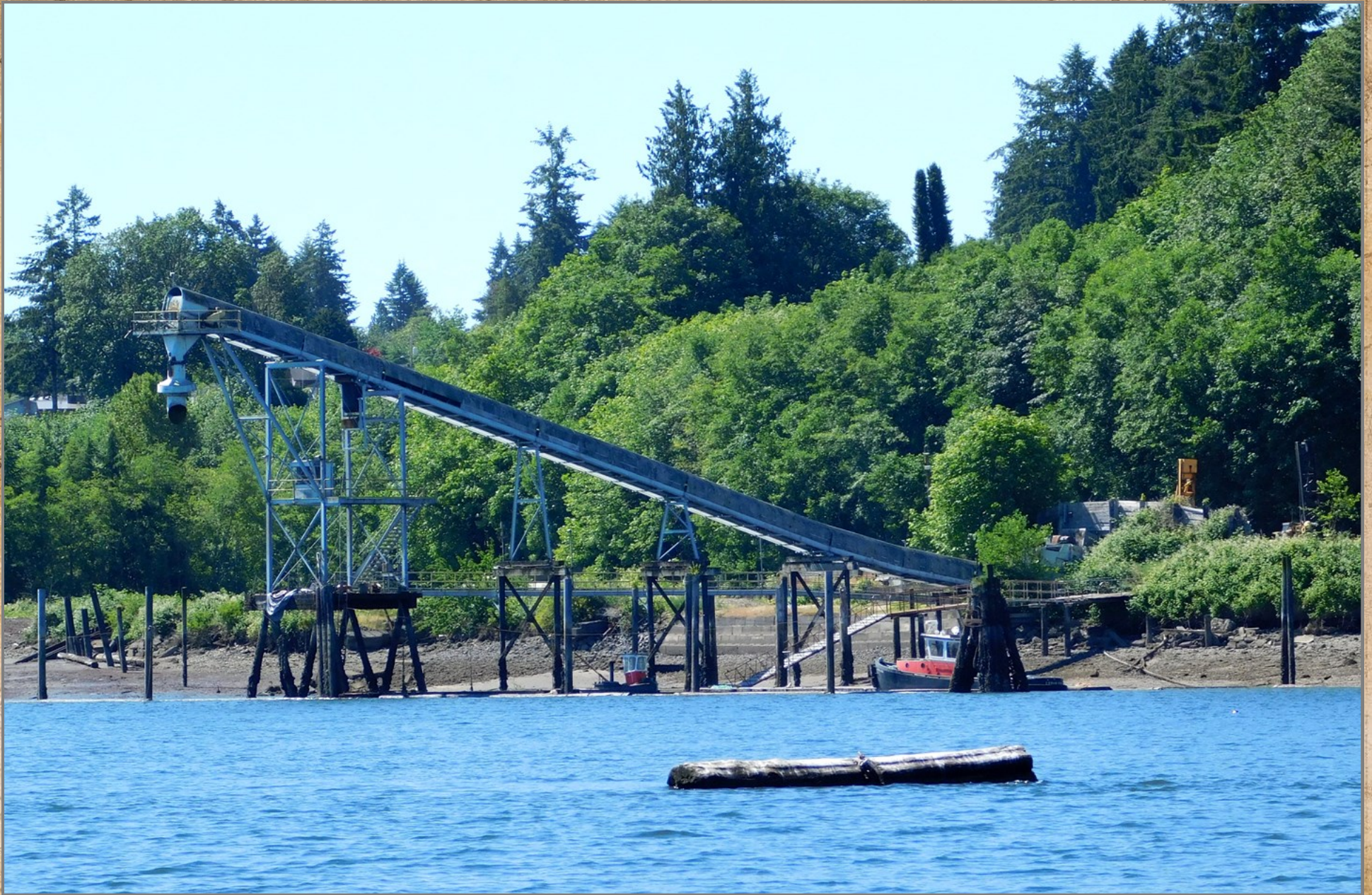
This log yard is owned and operated by Dunlap Towing Company, which was founded in 1925. The Yard is situated on historic Buchanan mill land from the 30s and 40s but has operated as a towing and logging facility for over 35 years.